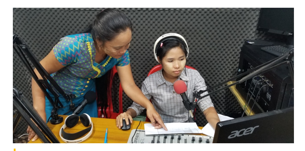
Community Radio Khayae FM, Myanmar.

week, which is important to help people remember a message and act accordingly. The ongoing campaign has so far has attracted more than 50 community radios from 13 countries of the Asia-Pacific region.