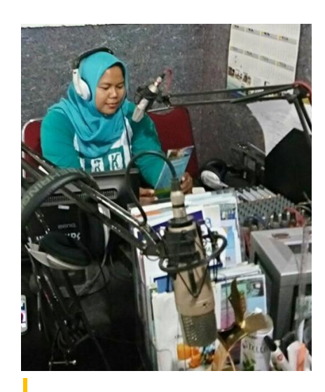
Citra Melati 107.7 FM Indonesia

To make up for radio activities, Gini has embraced internet technology. She shares authentic, timely information about COVID-19 and safety, mostly centering around child-parent relationship and other educational information. From the beginning of this pandemic, the station had to adjust its broadcast schedule to a maximum of three days a week. The radio is located in the red zone, categorized by the government, according to the risk